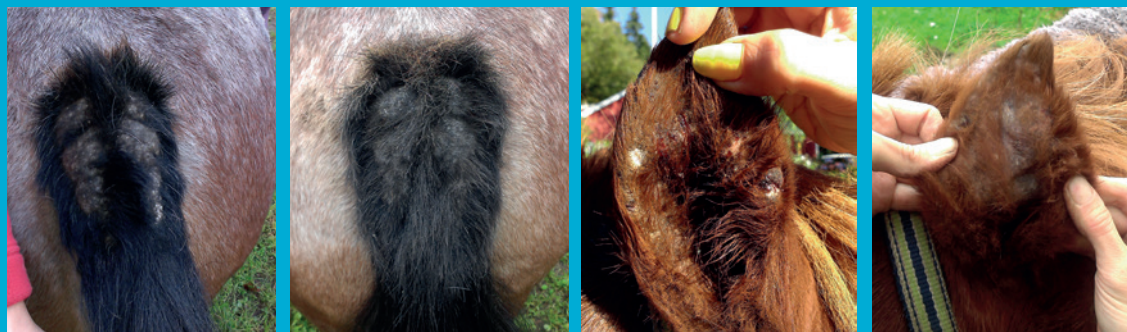
Tail hardened by chaffing before and after the treatment.

Summer dermatitis is the most common allergic skin disease on horses 1 . Summer dermatitis is an immunological disease where the body develops an oversensitivity reaction to the salivary gland proteins of flying biting insects 2-3 . Most common symptomatic areas are dorsal midline and the base of mane and tail, head and often ears 4 .